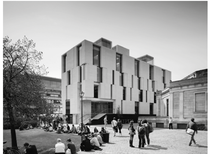
Trinity Long Room Hub

Since 1950, Trinity College Dublin has greatly contributed to the stock of fine modernist architecture in Dublin both with new buildings and adaptations of historic ones. These include the Berkeley Library (1967) with its predominant white reinforced concrete and the Dublin Dental Hospital (1894-6) with a dramatic rooftop, which was remodelled by McCullough Mulvin Architects in 2010.